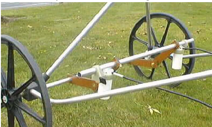
Horizontal gradiometer mount