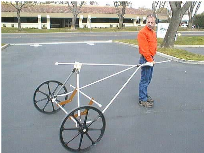
Assembly for use as horizontal gradiometer