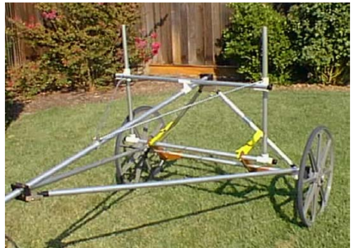
Custom configuration for combined vertical and horizontal gradiometers