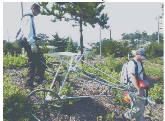
Surveying using a 4-sensor configuration