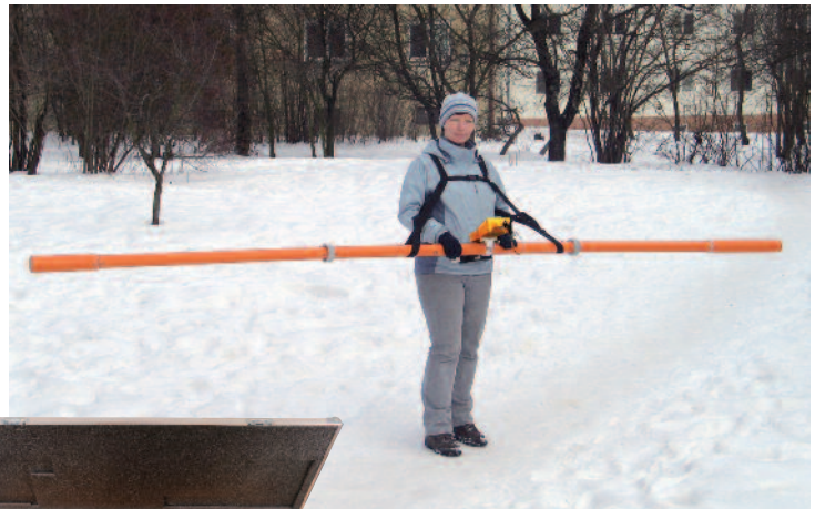
CMD - 4 single-depth probe with 6.0 / 3.0 m depth range with wide sphere of applications (geological survey, mapping of pollution plumes, raw material prospecting).