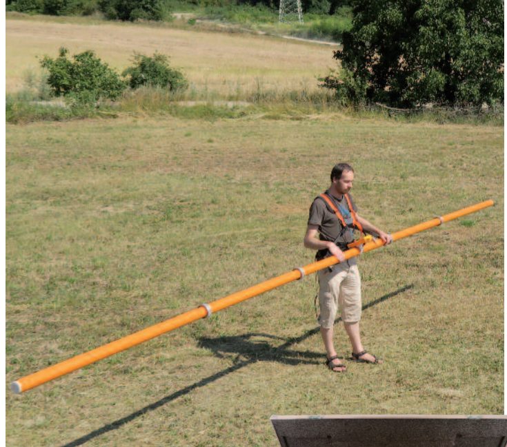
CMD - 4/6 single-depth probe with variable depth range 6.0 / 3.0 m or 9.0 / 4.5 m for similar purposes like CMD-4 with significantly enhanced survey depth.