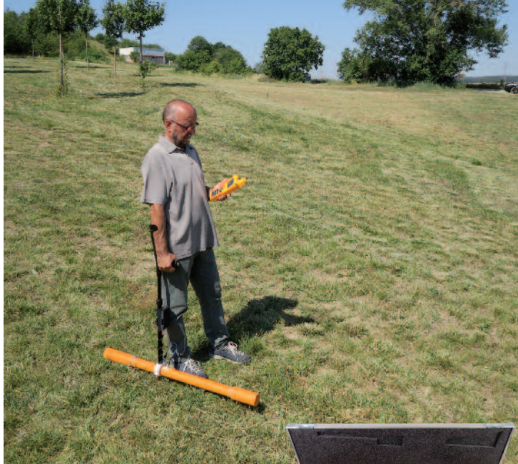
CMD - 1 economy single-depth probe with 1.5 / 0.75 m depth range for archeology, agriculture and buried metal object detection.