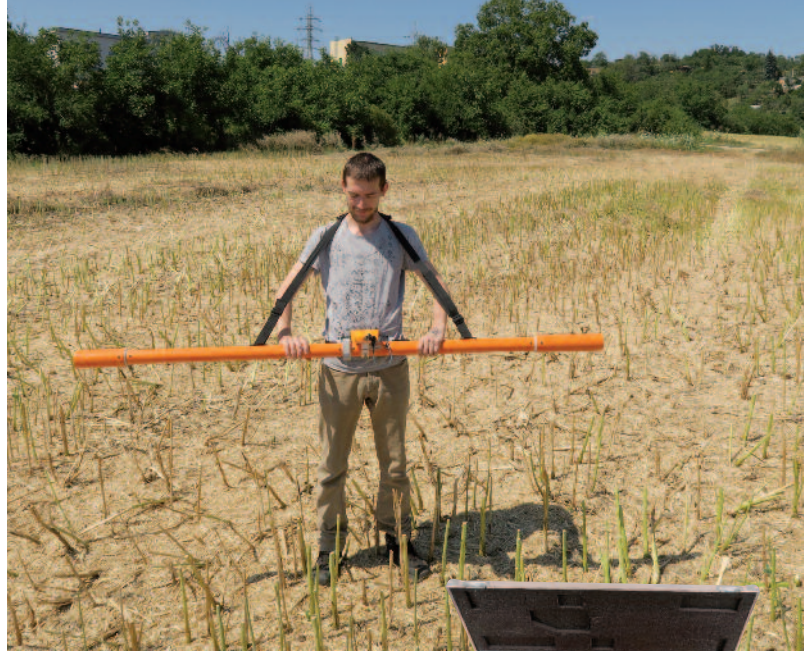
CMD - 2 single-depth probe with 3.0 / 1.5 m depth range frequently used for assessment of corrosivity risk at pipeline construction and for geologic judgement of construction sites.