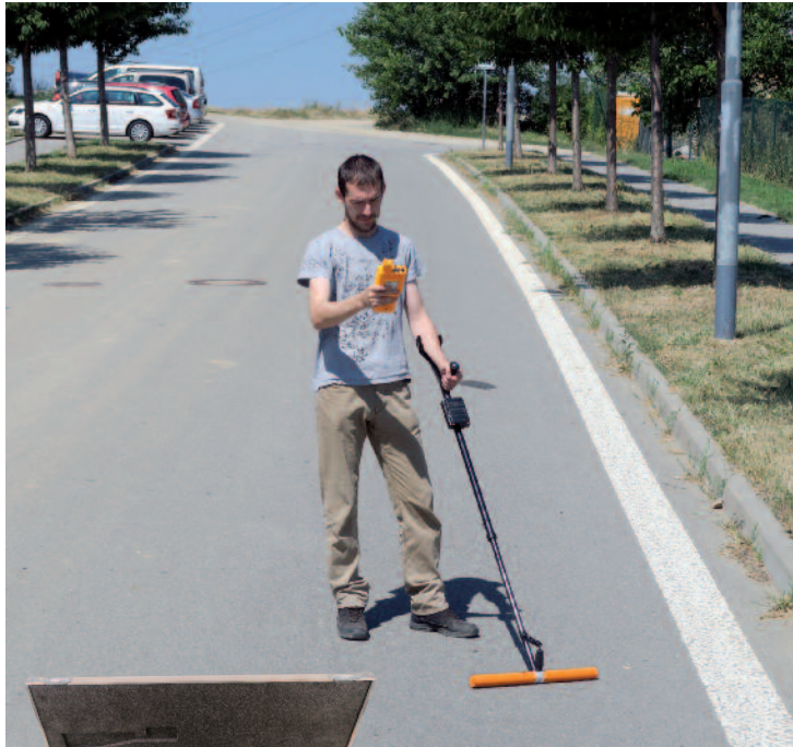
CMD - Tiny single-depth probe with 0.7 / 0.35 m depth range for assessment of very shallow objects in the frame of civil engineering, agriculture and archaeology.