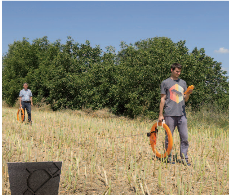
CMD - DUO single-depth, two-men operated probe with variable depth range 15 / 7.5 m or 30 / 15 m or 60 / 30 m for measurement of deeper situated structures (weathered zones, bedrock, cavities).