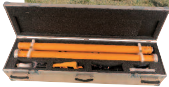
CMD-Explorer three-depth probe with depth ranges 2.2 / 1.1 m, 4.2 / 2.1 m, 6.7 / 3.3 m for extra wide range of applications with evaluation of vertical and horizontal conductivity changes.